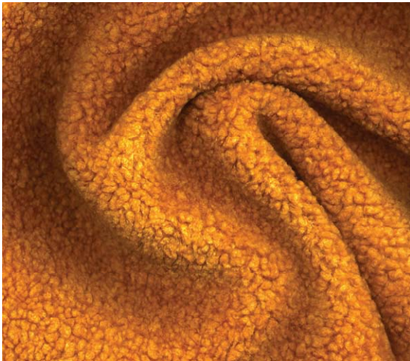
Glenoit's popular 'Nubby Pebble' pile

At the same time Tarboro Textiles was ramping up Glenoit, recent economic uncertainties, the costs of transportation and other financial pressures caused Haixin to rethink its strategies. It entered into negotiations with Tarboro to take total control of Glenoit's North America textile production. With backing from a local businessman, support from Concept III, Trienekens and the local community, Glenoit Fabrics TT Corporation did so on April 1, of this year.