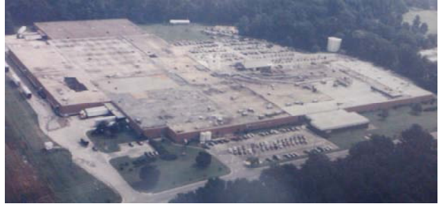
The Glenoit factory, Tarboro NC

Close-to-home sourcing of both raw materials and sewing has become more important recently to brand manufacturers who are now less able to project more than six months out for their orders. The new efficiency at Glenoit now allowed for a tighter production window.