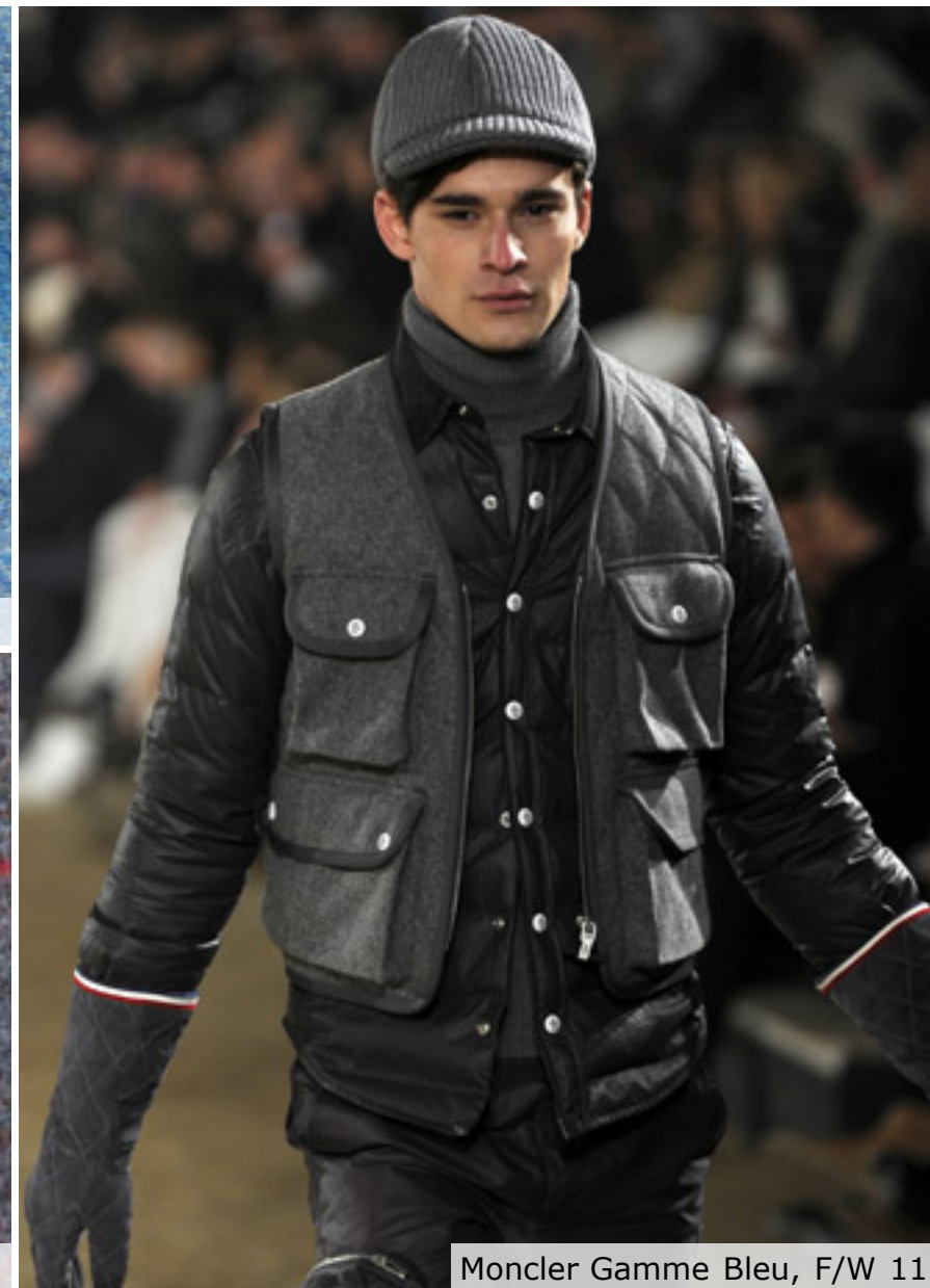
Moncler Gamme Bleu, F/W 11