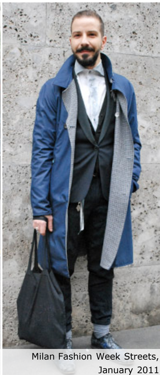
Milan Fashion Week Streets, January 2011