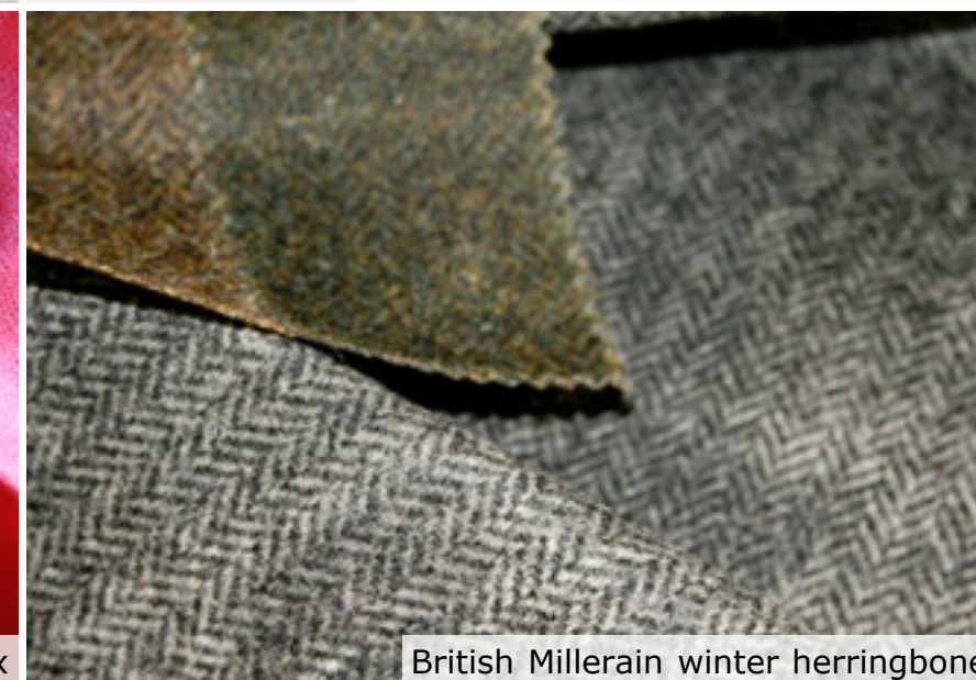
British Millerain winter herringbone