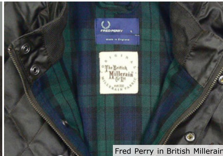
Fred Perry in British Millerain