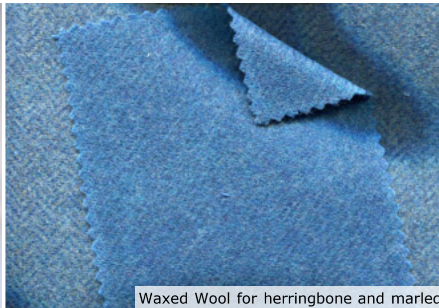
Waxed Wool for herringbone and marled