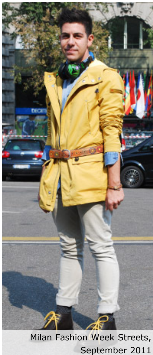
Milan Fashion Week Streets, September 2011