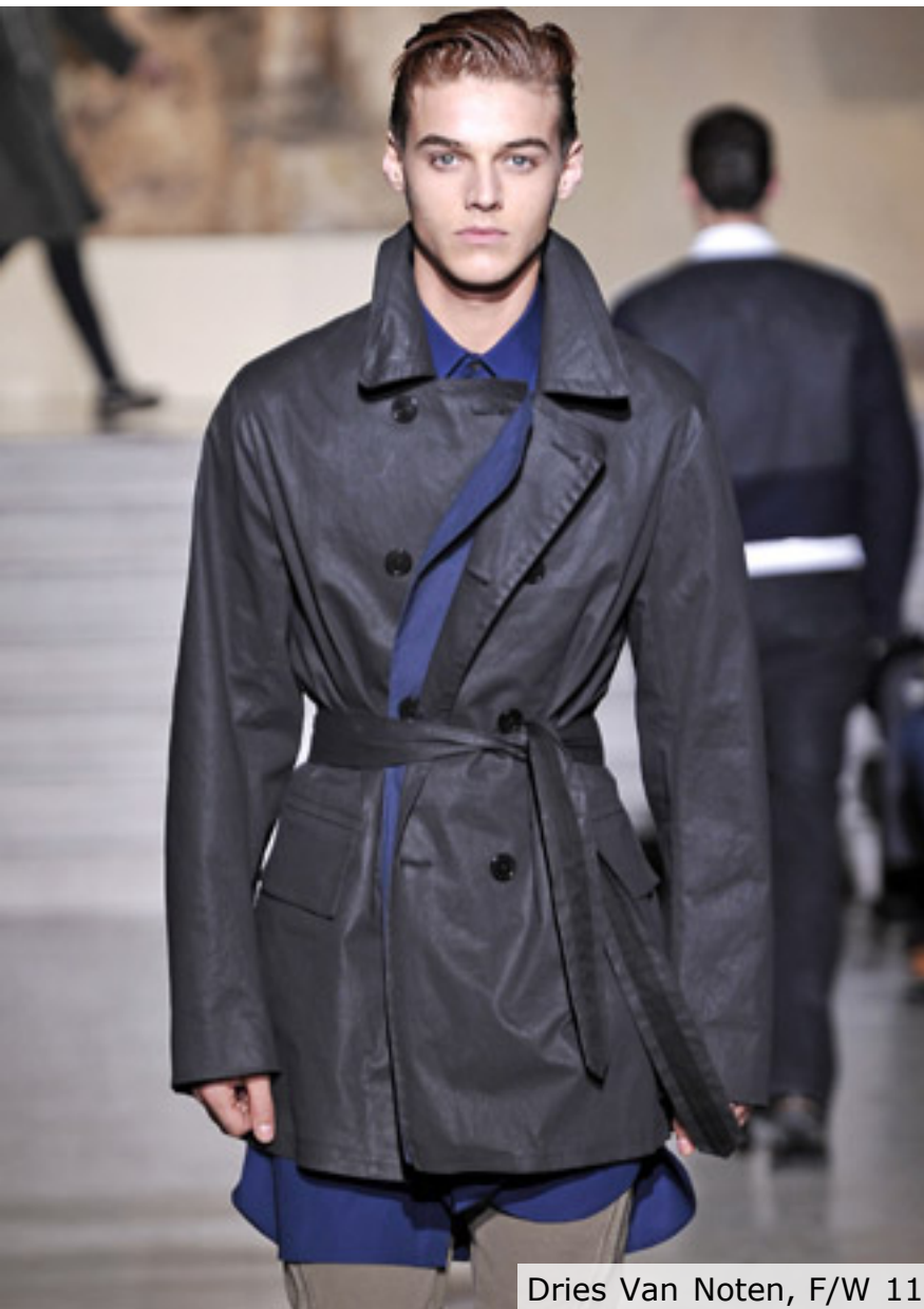
Dries Van Noten, F/W 11