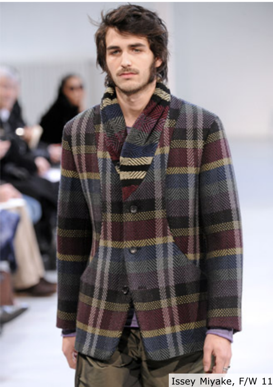
Issey Miyake, F/W 11