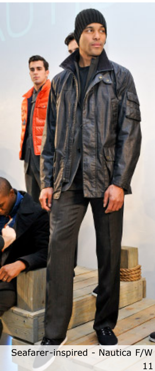
Seafarer-inspired - Nautica F/W 11