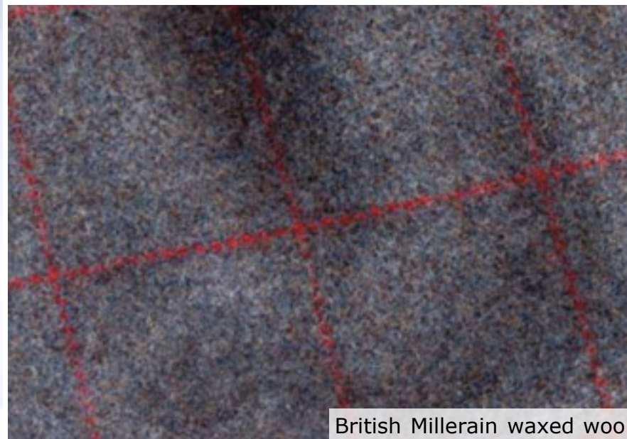
British Millerrain waxed wool