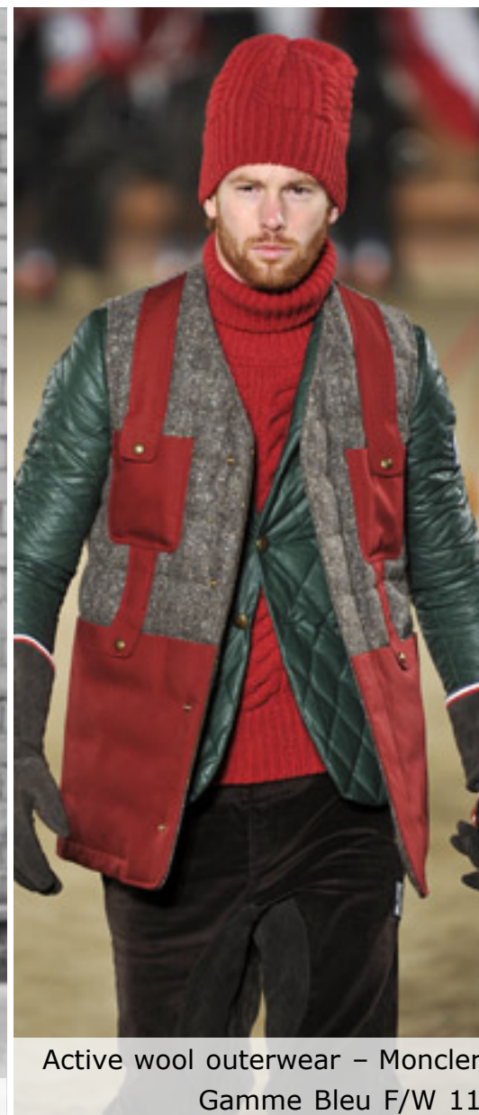
Active wool outerwear – Moncler Gamme Bleu F/W 11