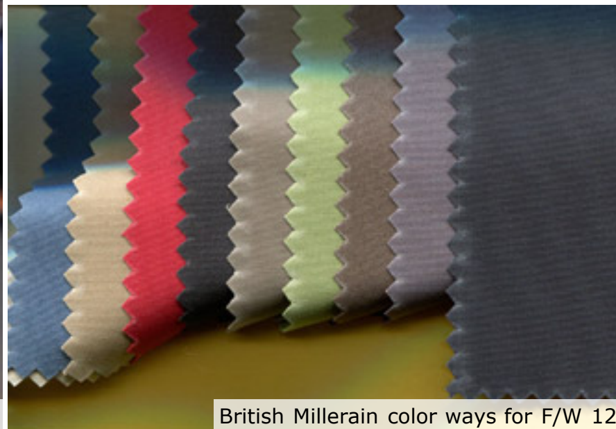
British Millerrain color ways for F/W 12