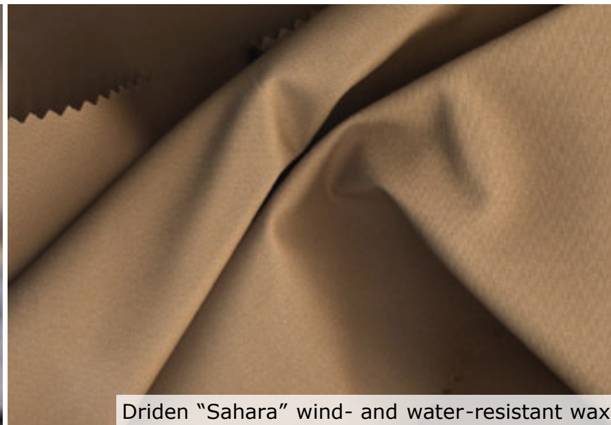
Driden "Sahara" wind- and water-resistant wax