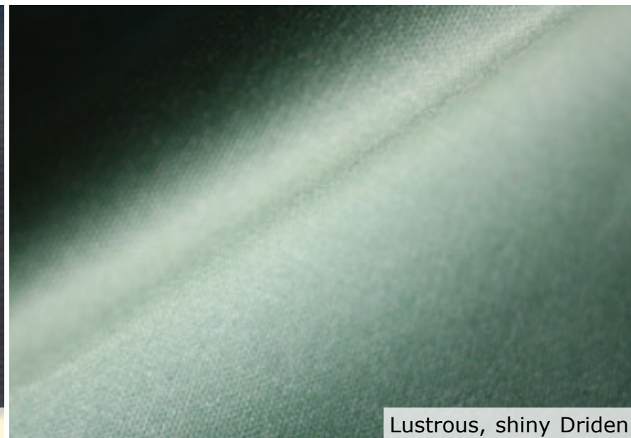
Lustrous, shiny Driden