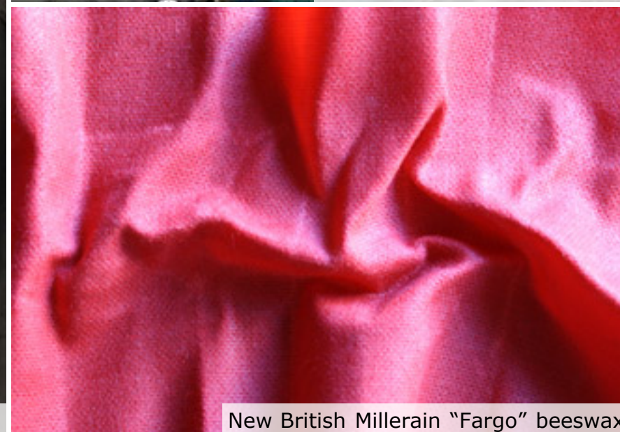
New British Millerain "Fargo" beeswax