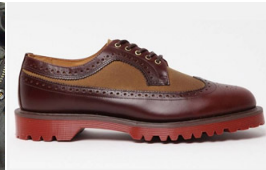
Dr. Martens with British Millerain wax