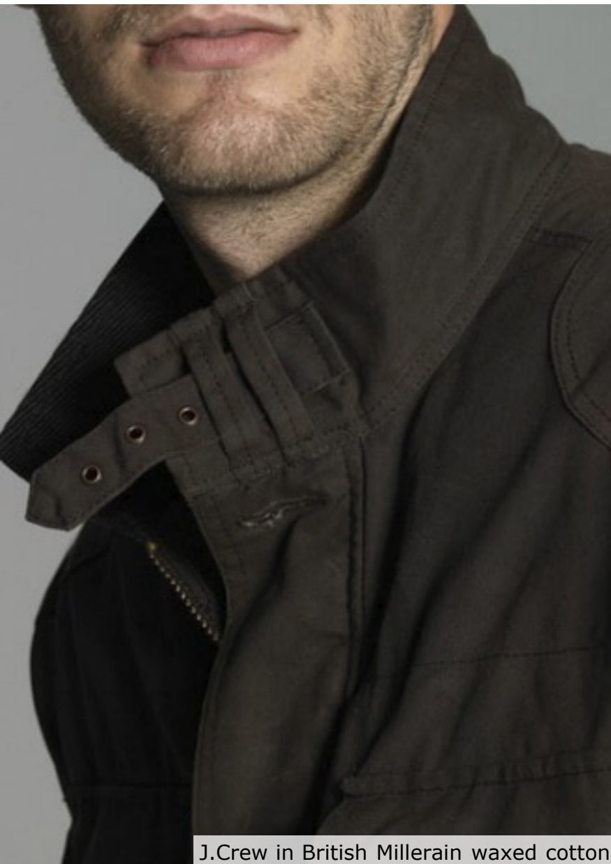
J.Crew in British Millerain waxed cotton