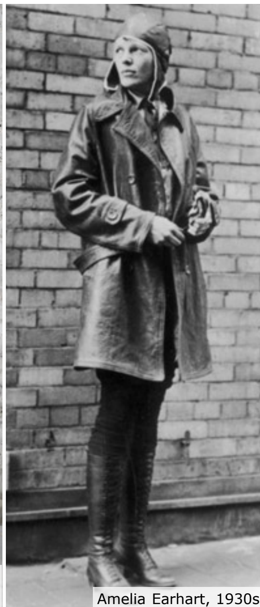
Amelia Earhart, 1930s